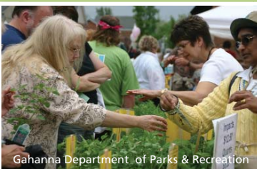
Gahanna Department of Parks & Recreation